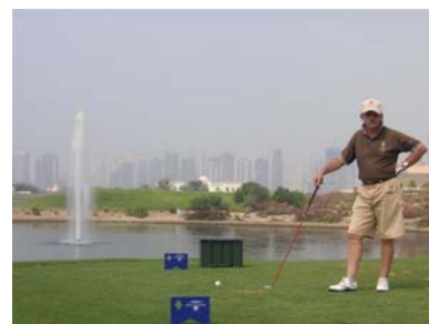
1 st Tee at Dubai

Shop 2B Metro West Centre 620 Moggill Road, Chapel Hill Queensland 4069 Phone: (07) 3720 1237 • Mobile: 0418 754 717 Email: shop@vanityfairways.com.au Web: www.vanityfairways.com.au