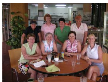
Babes enjoying Kooralbyn!